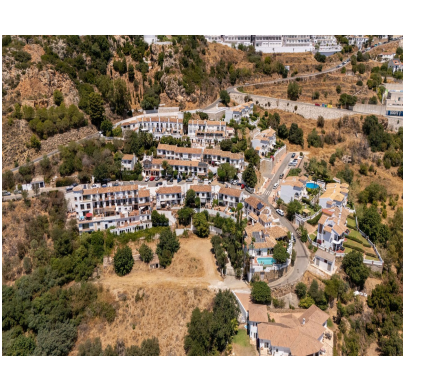
Ref.-ID: MIBGR4799749 Mijas House