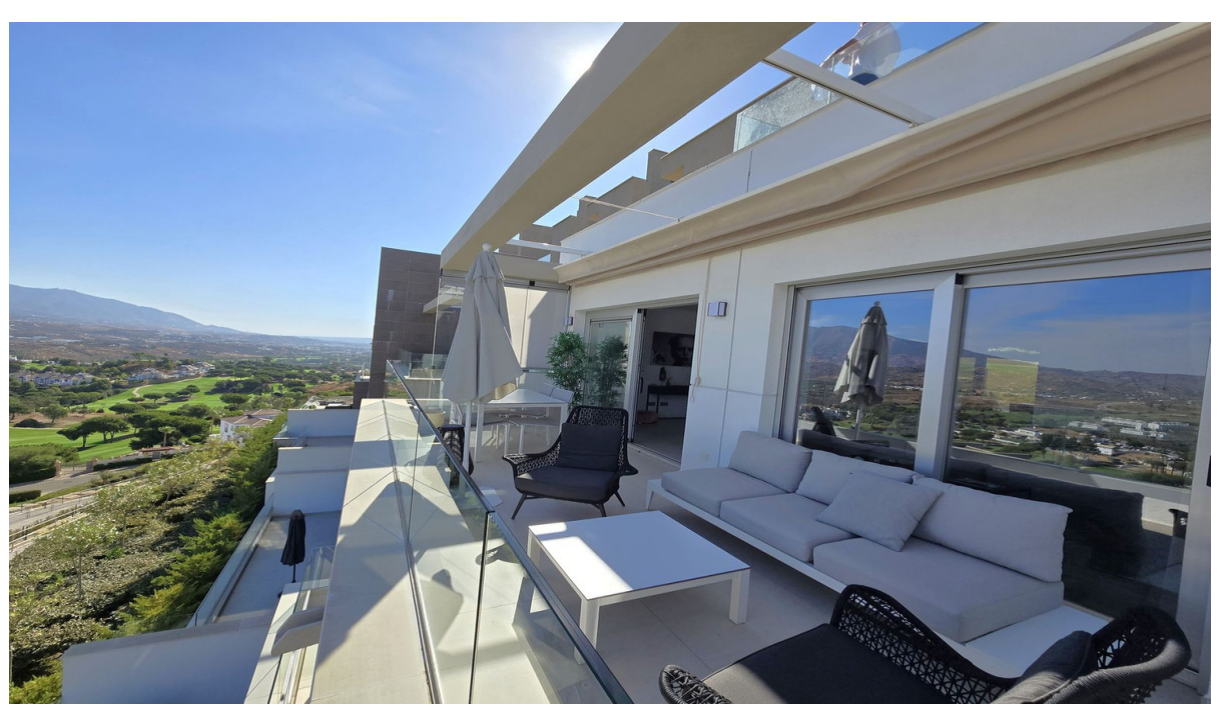
La Cala Golf