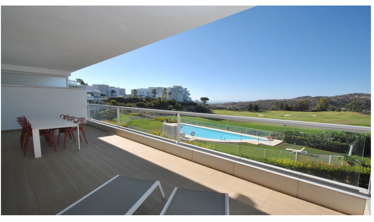
La Cala Golf