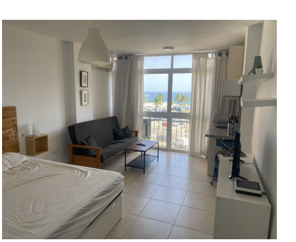
Ref.-ID: MIBGR4828303 Torremolinos

Community: 516 EUR / year IBI: 116 EUR / year