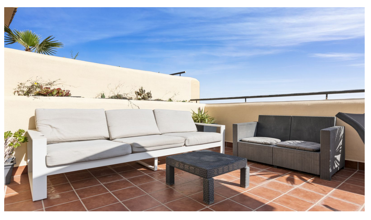
La Cala de Mijas