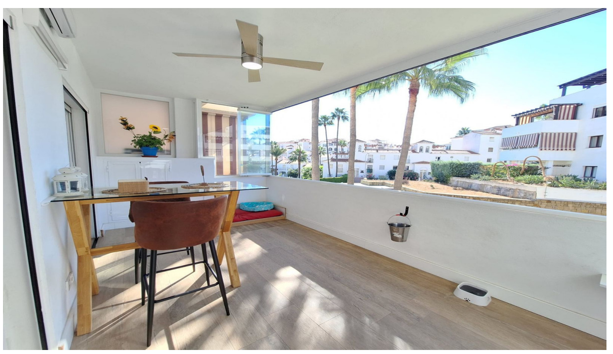
Riviera del Sol