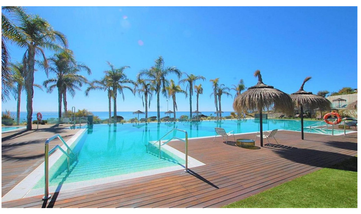
La Cala de Mijas