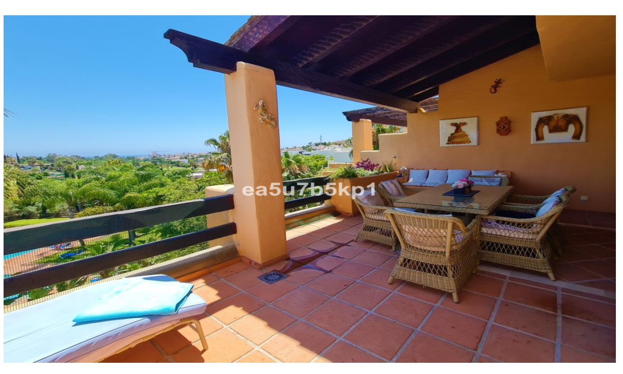
New Golden Mile