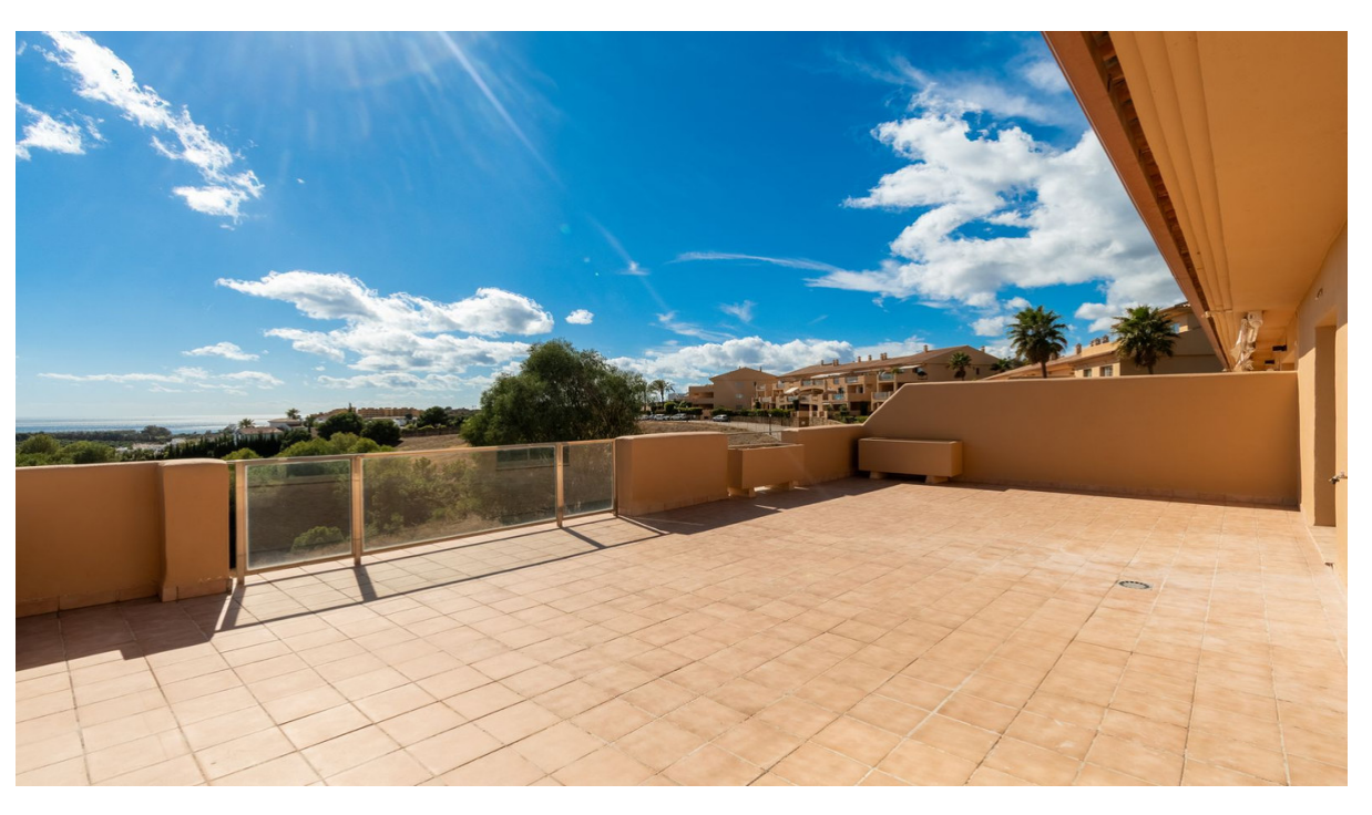
New Golden Mile