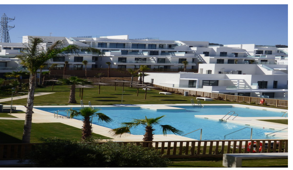
La Cala de Mijas

IBI: 905 EUR / year Rubbish: 110 EUR / year