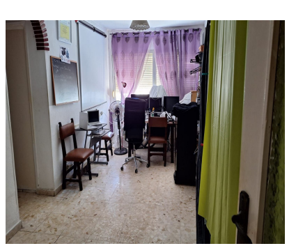
Ref.-ID: MIBGR4870972 Arroyo de la Miel