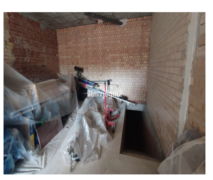
Ref.-ID: MIBGR4876171 Cabopino Commercial