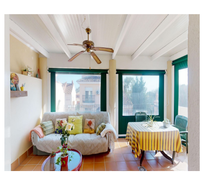
Ref.-ID: MIBGR4879273 Benalmadena Pueblo

IBI: 785 EUR / year Rubbish: 109 EUR / year