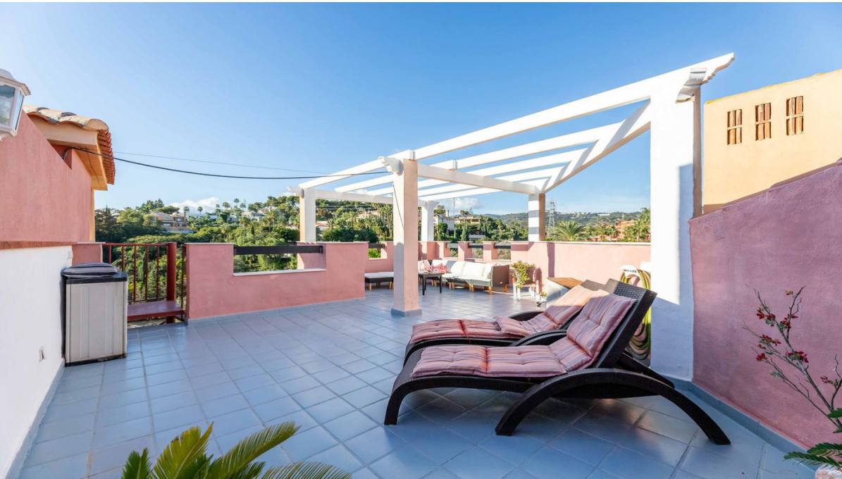
Reserva de Marbella