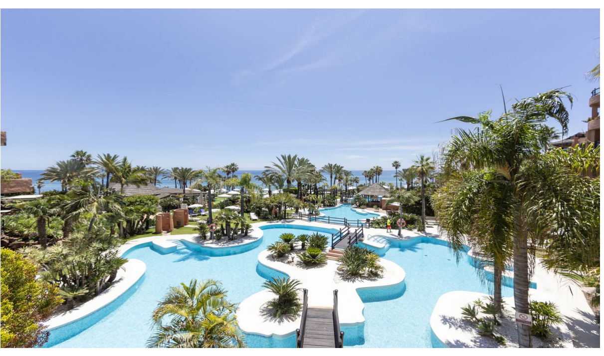
New Golden Mile