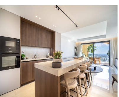
Ref.-ID: MIBGR4881244 Benahavís

Community: 5,256 EUR / year IBI: 589 EUR / year