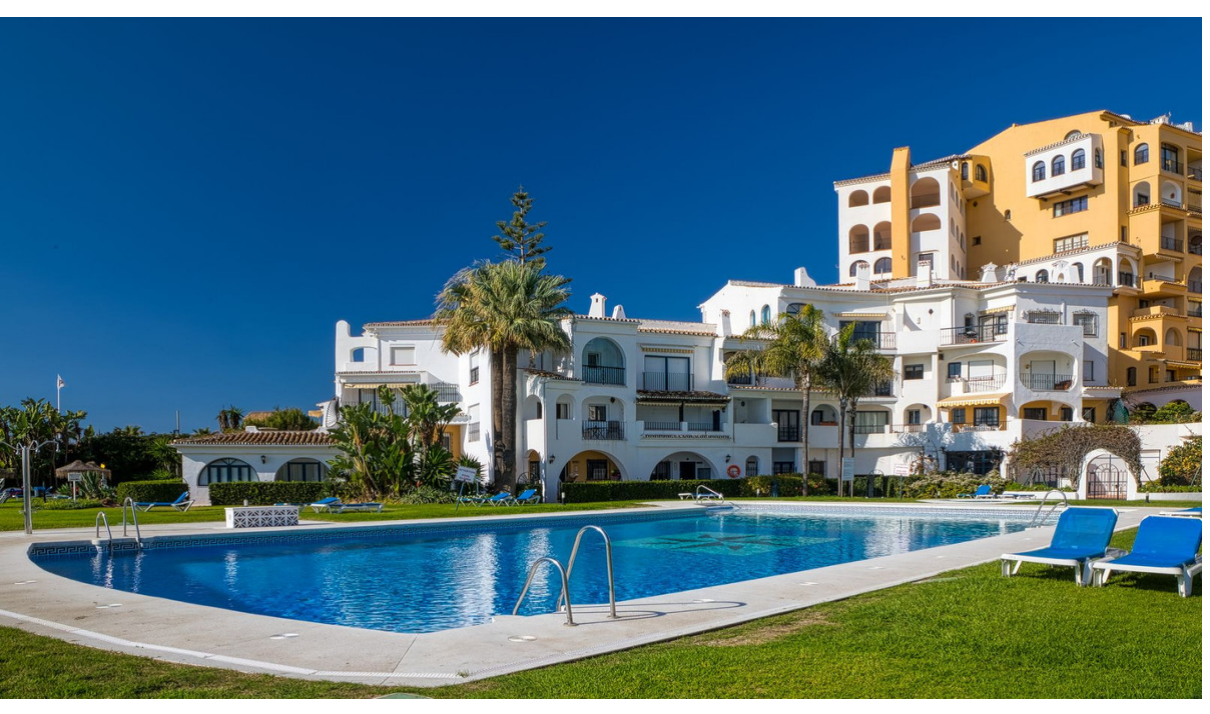
Puerto de Cabopino