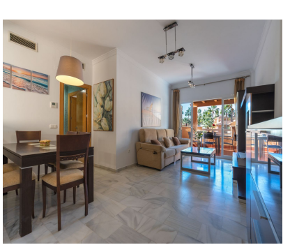
Ref.-ID: MIBGR4887865 Cabopino