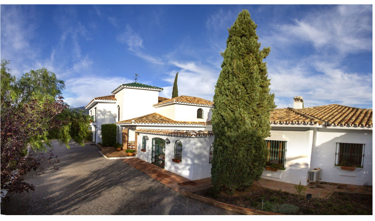
La Cala Golf