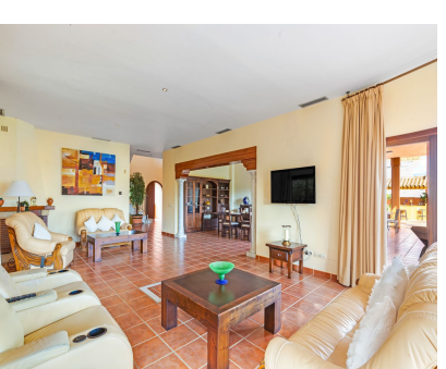
Ref.-ID: MIBGR4894894 Be

Community: 2,256 EUR / year IBI: 1,761 EUR / year