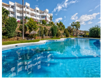
Ref.-ID: MIBGR4895614 Calahonda Apartment