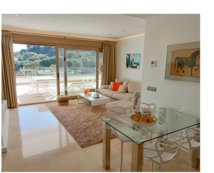
La Cala Golf Apartment