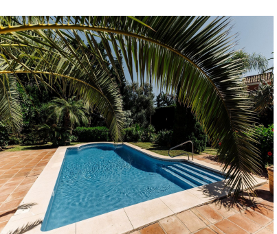
Ref.-ID: MIBGR4907305 Bahía de Marbella

Community: 1,560 EUR / year IBI: 3,000 EUR / year Rubbish: 185 EUR / year