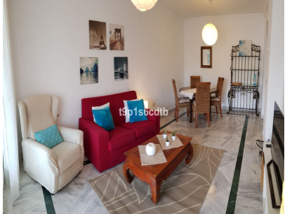
Nueva Andalucía Apartment