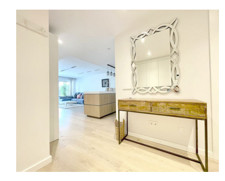
Puerto Banús Apartment