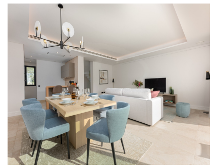
Ref.-ID: MIBGR4695136 Nueva Andalucía