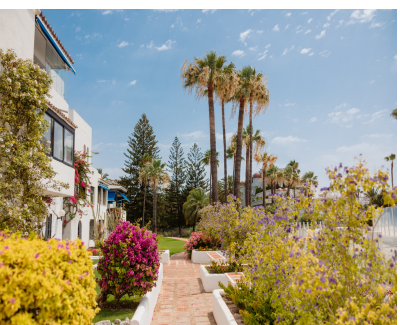
Puerto Banús Apartment