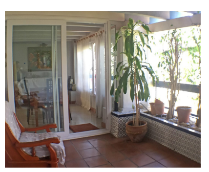
Ref.-ID: MIBGR2800997 Marbella Apartment