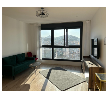
Ref.-ID: MIBGR4817359 Málaga Centro Apartment