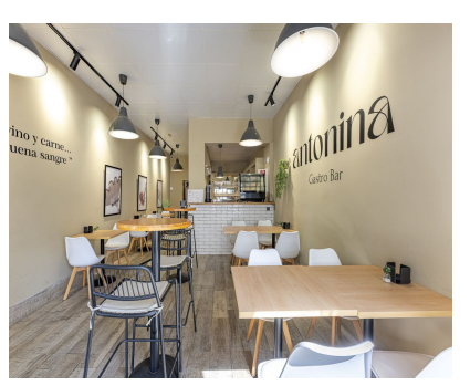
Ref.-ID: MIBGR4835884 Marbella Commercial