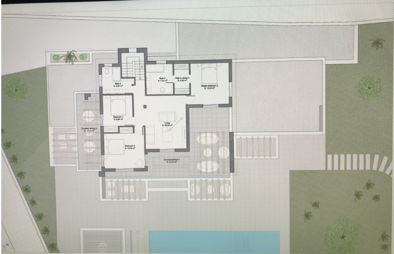
P04 HOUSING IN "URBANIZACIÓN EL HERROJO", 46, BENAHAIVIS (MÁLAGA)