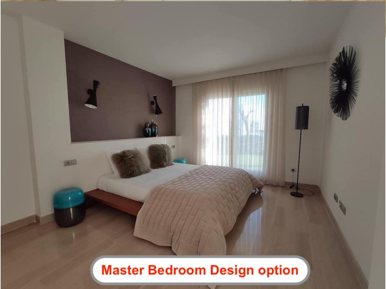
Master Bedroom Design option