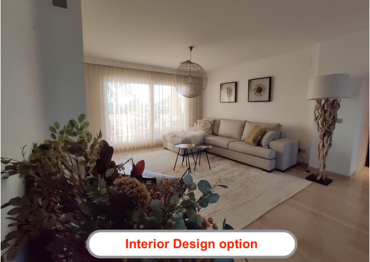
Interior Design option