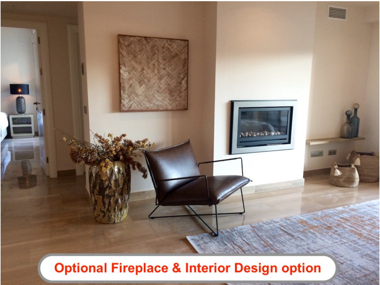
Optional Fireplace & Interior Design option