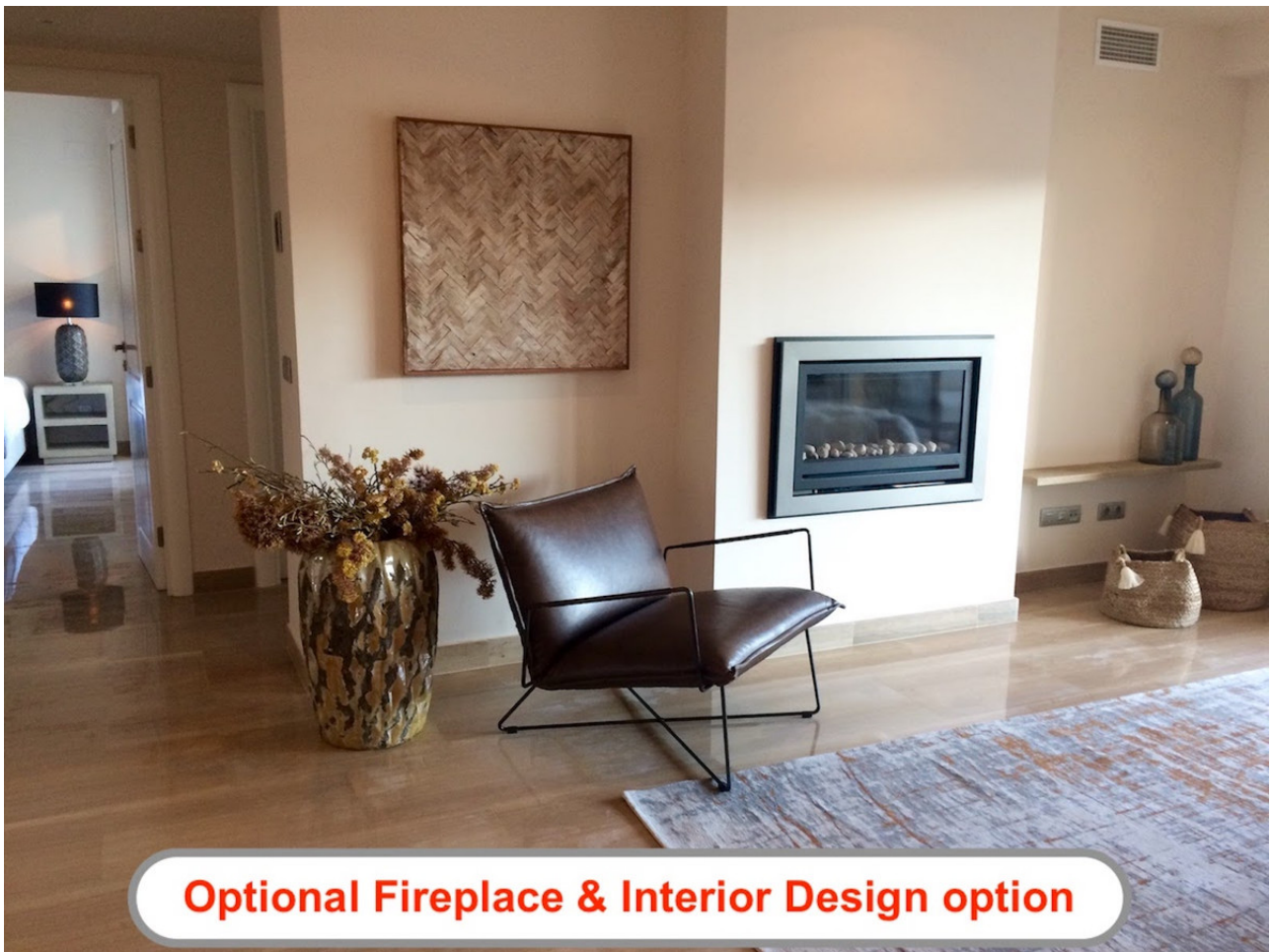
Optional Fireplace & Interior Design option