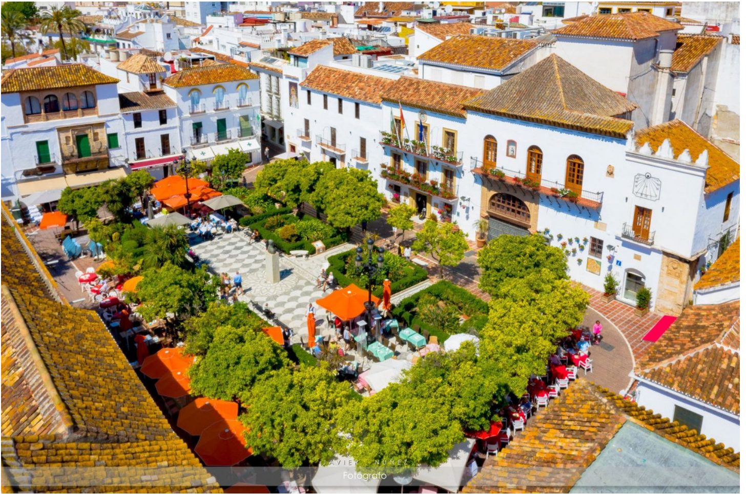
JAVIER NÚÑEZ Fotógrafo