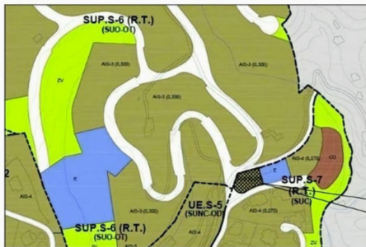
3 Situación en el PGOU 1:2000