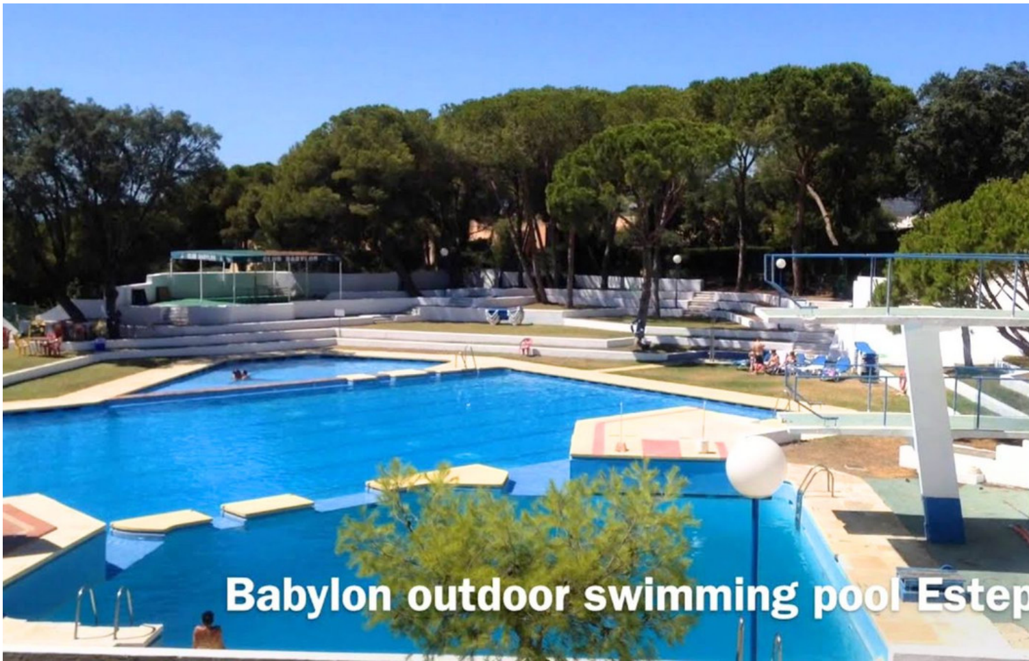
Babylon outdoor swimming pool Estep