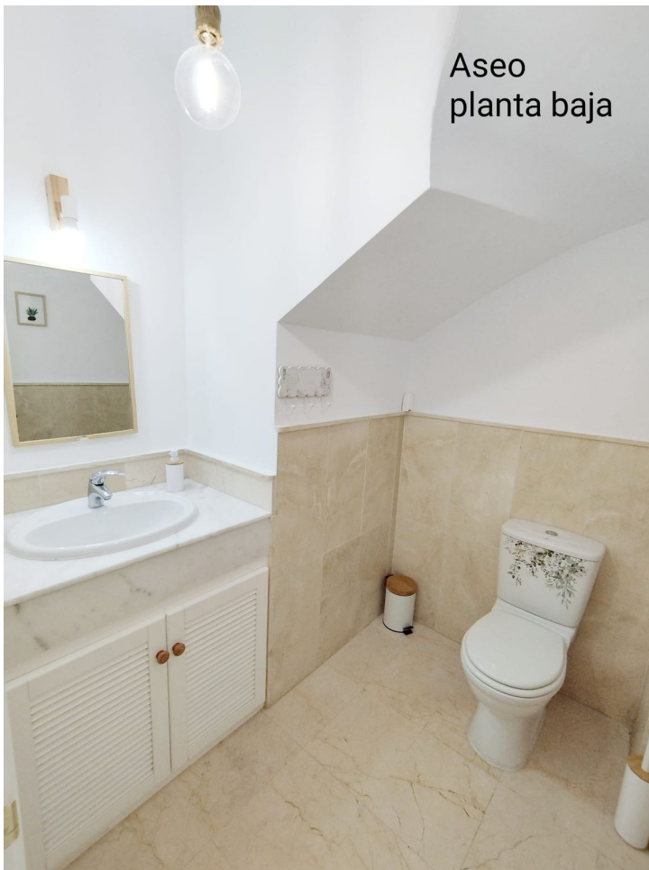
Aseo planta baja