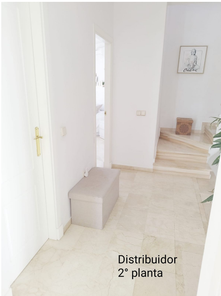
Distribuidor 2° planta