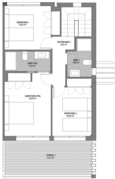
PLANTA ALTA 1 : 75