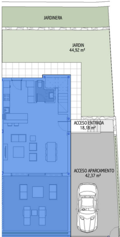
EMPLAZAMIENTO 1 : 200

Las superficies indicadas están calculadas conforme al Decreto 218/2005 de información al consumidor en la compraventa y arrendamiento de viviendas en Andalucía.