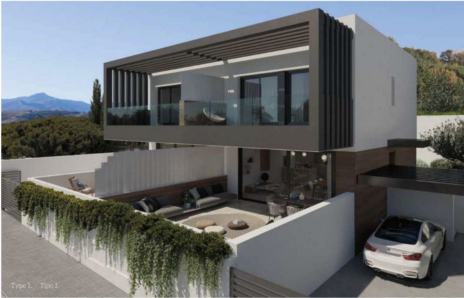
Type 1. Tipo 1.