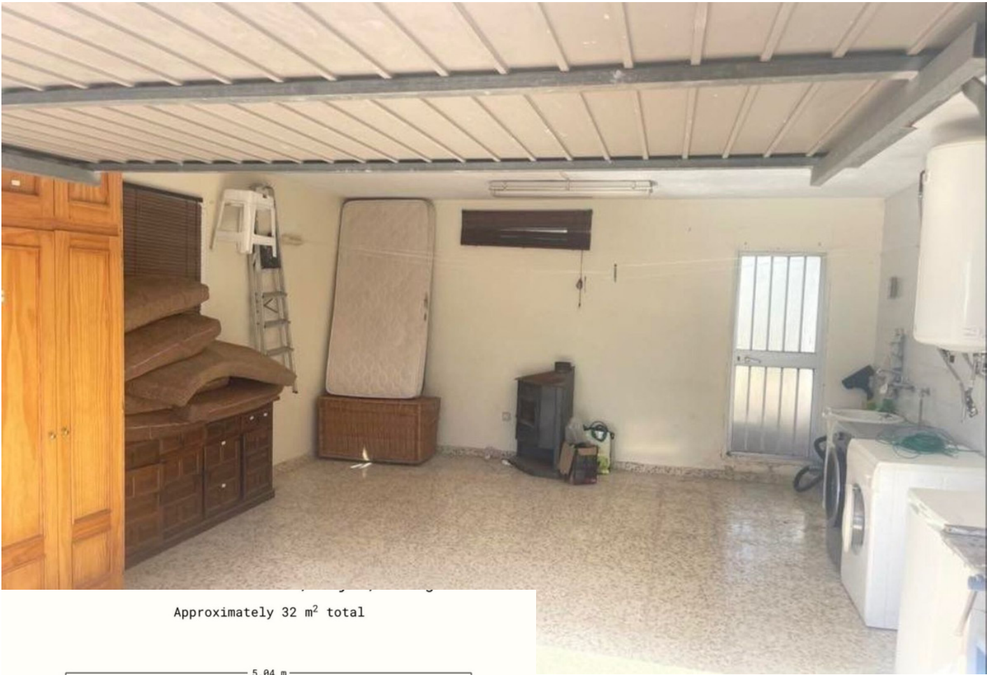
Approximately 32 m 2 total