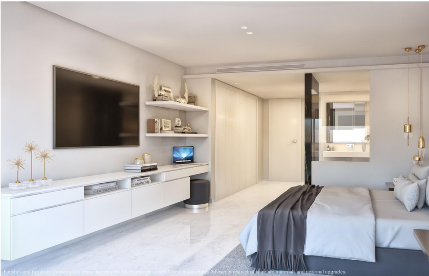
Finishes and furniture shown in this image are used for illustrative purposes. Consult your Sales Adviser in respect of standard materials and optional upgrades.