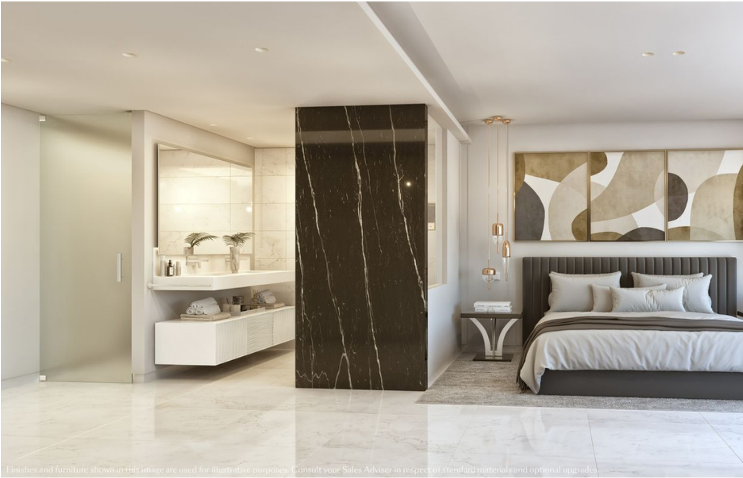
Finishes and furniture shown in this image are used for illustrative purposes. Consult your Sales Adviser in respect of standard materials and optional upgrades.