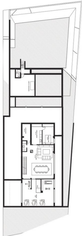
PLANTA SÓTANO BASEMENT