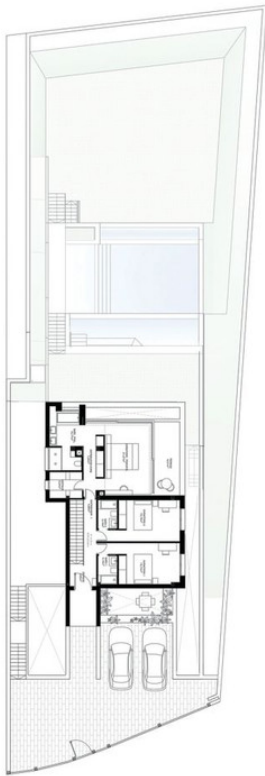
PLANTA PRIMERA FIRST FLOOR