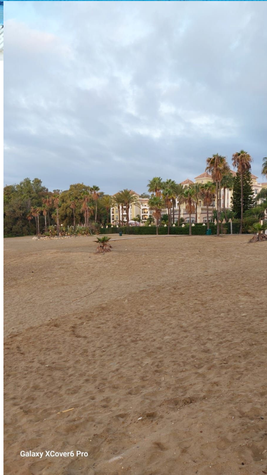
Galaxy XCover6 Pro