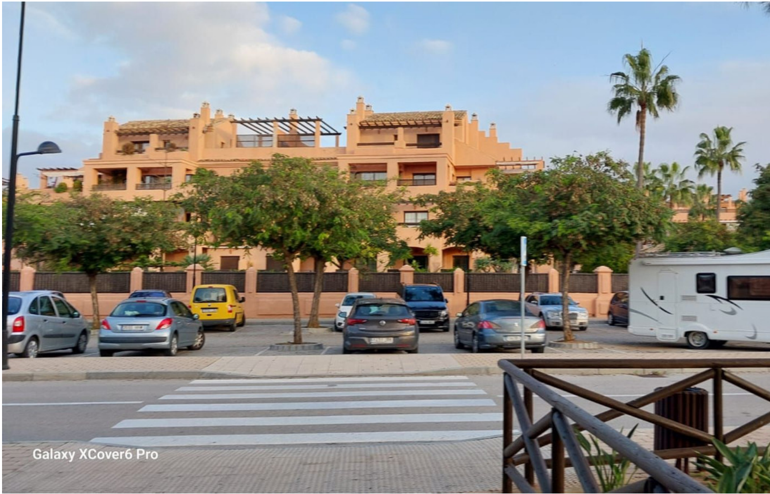
Galaxy XCover6 Pro