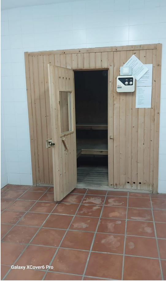
Galaxy XCover6 Pro