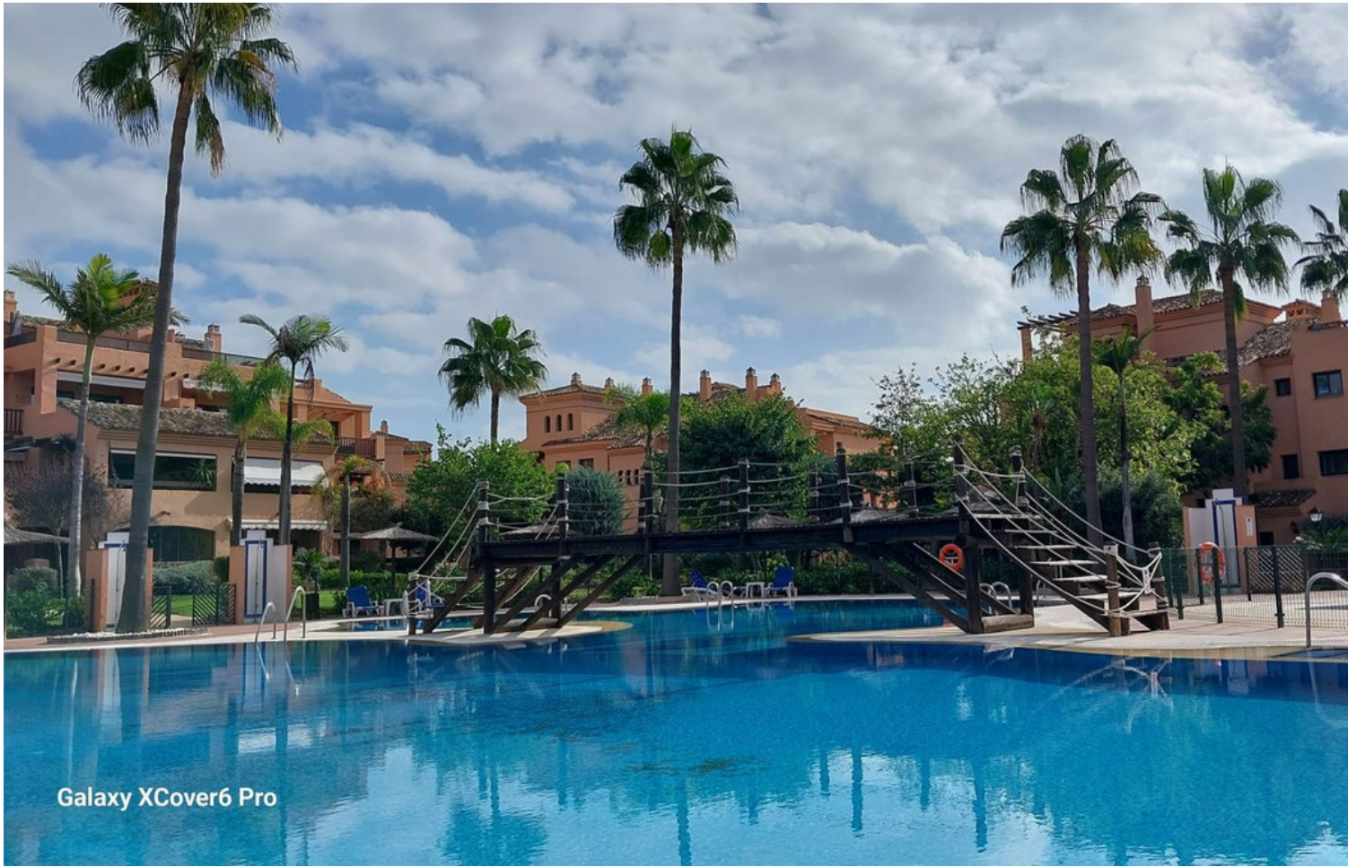
Galaxy XCover6 Pro