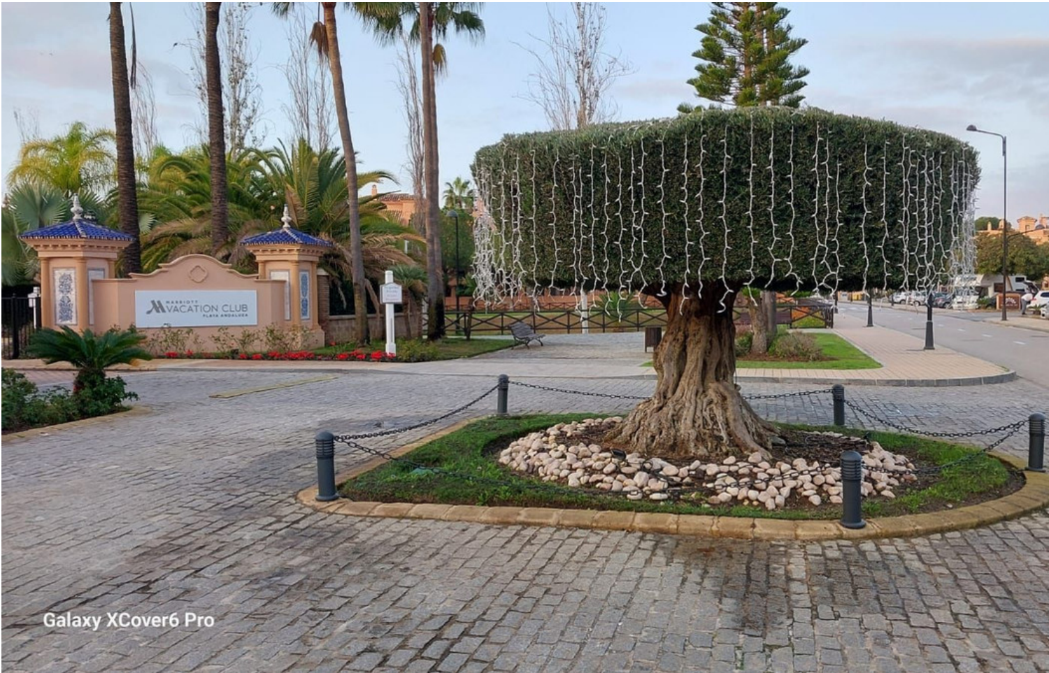
Galaxy XCover6 Pro