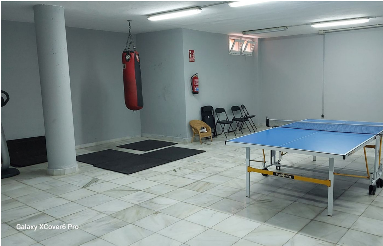
Galaxy XCover6 Pro