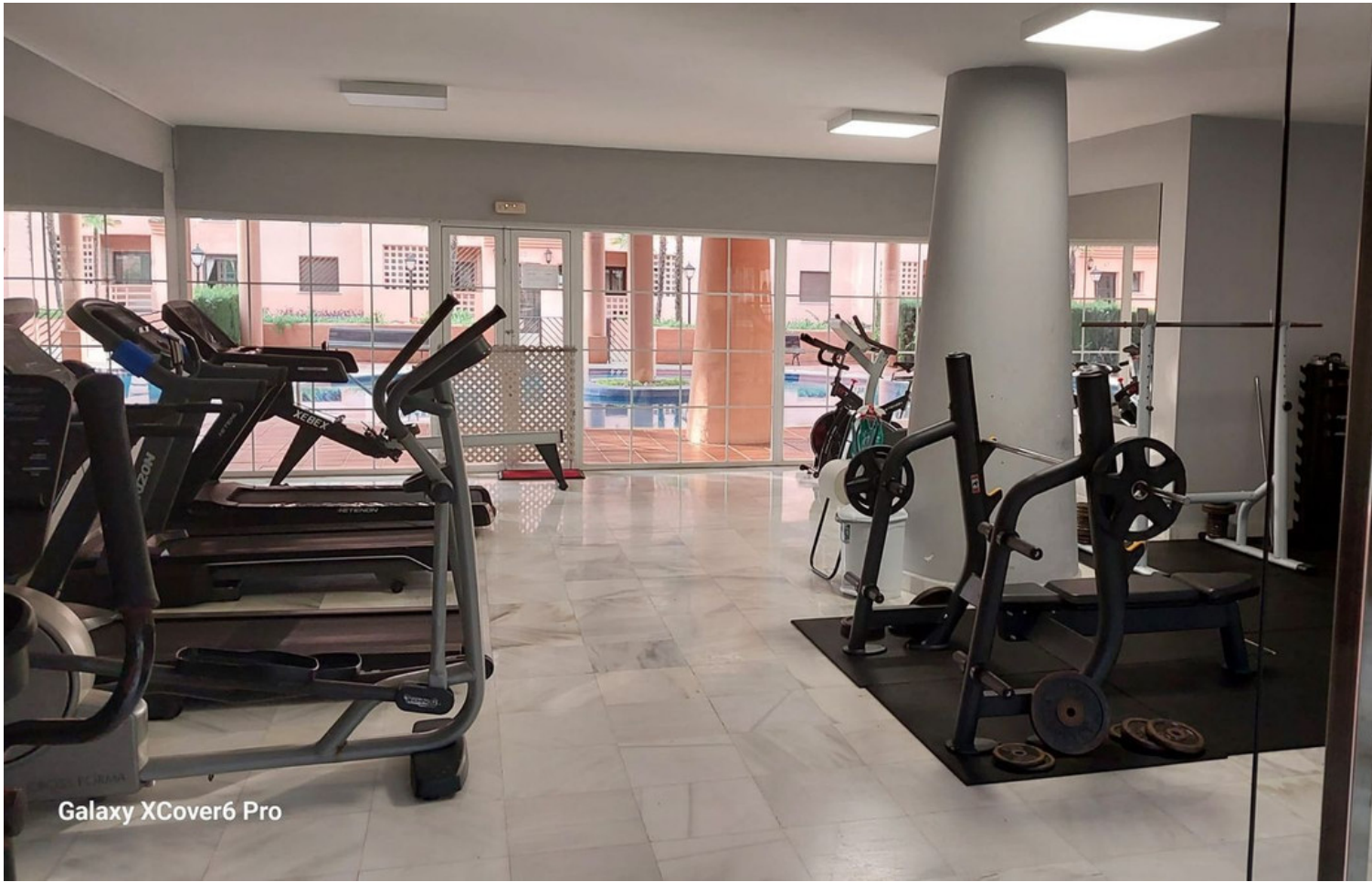
Galaxy XCover6 Pro