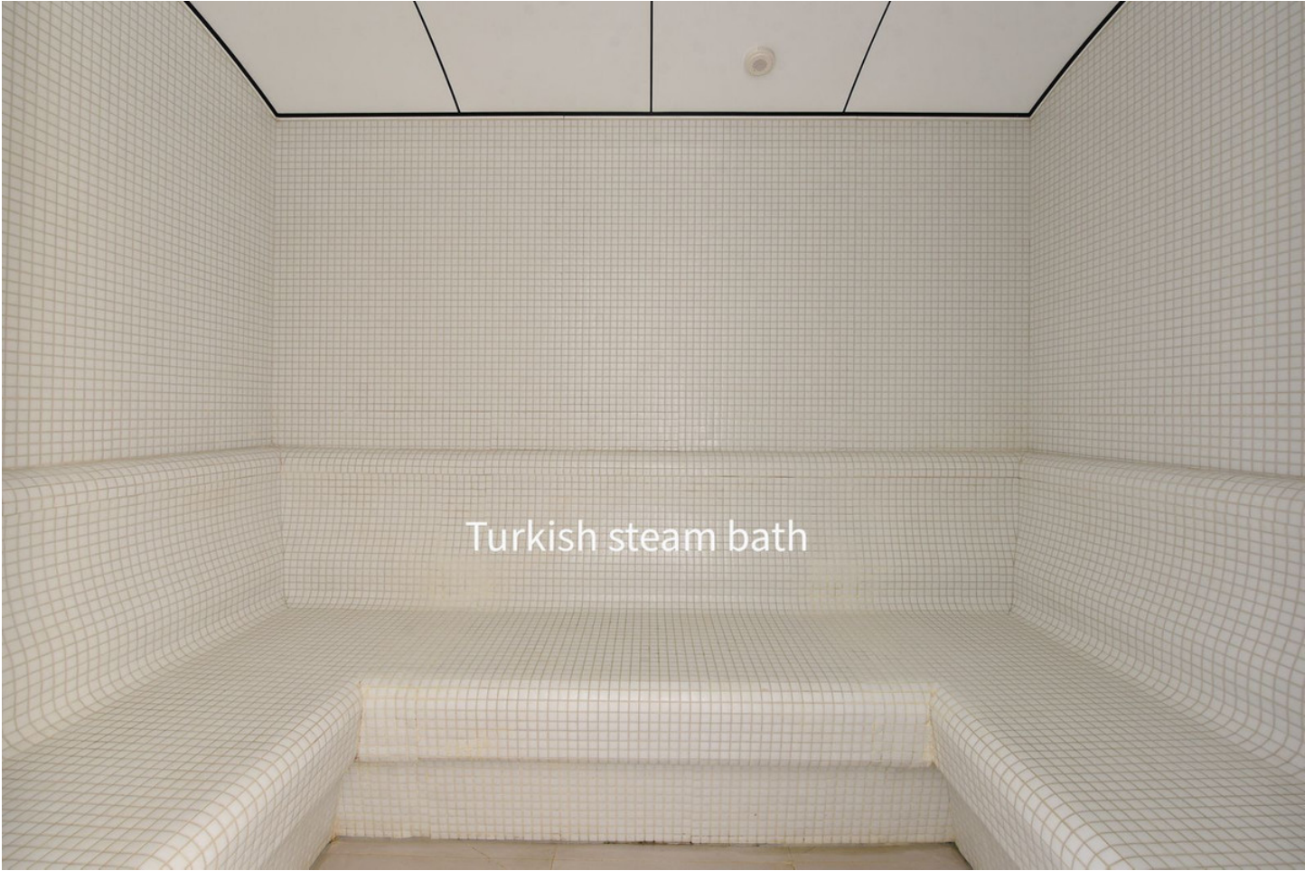
Turkish steam bath