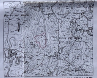
SITUACION DE LA PARCELA SOBRE PLANO TOPOGRAFICO . ESCALA 1:10.000