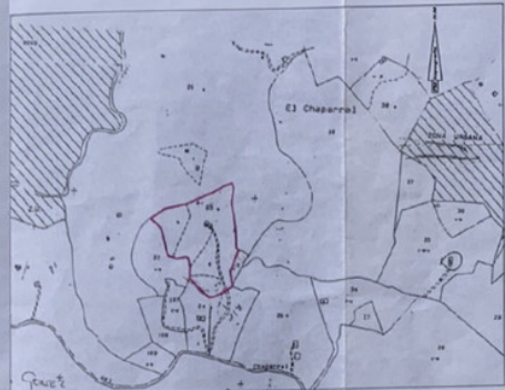
SITUACION DE LA PARCELA SOBRE PLANO DE CATASTRO . ESCALA 1:5.000