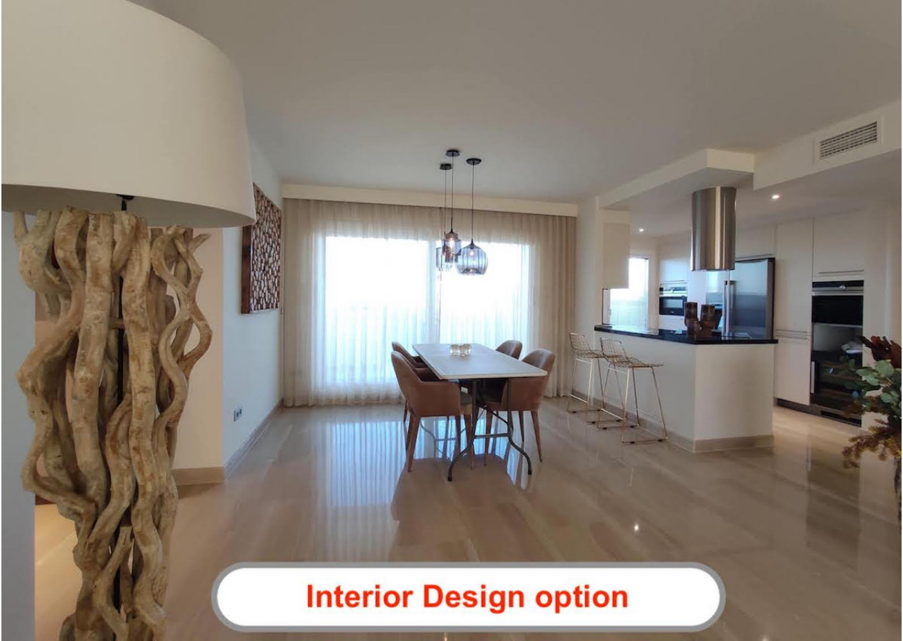
Interior Design option