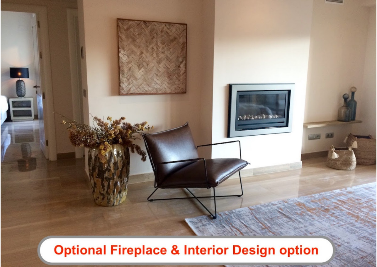
Optional Fireplace & Interior Design option