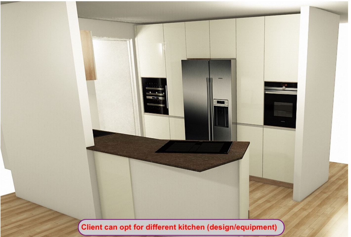
Client can opt for different kitchen (design/equipment)