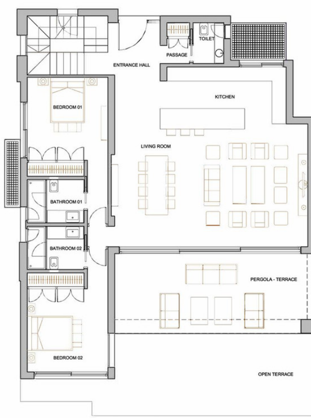
PLANTA BAJA GROUND FLOOR