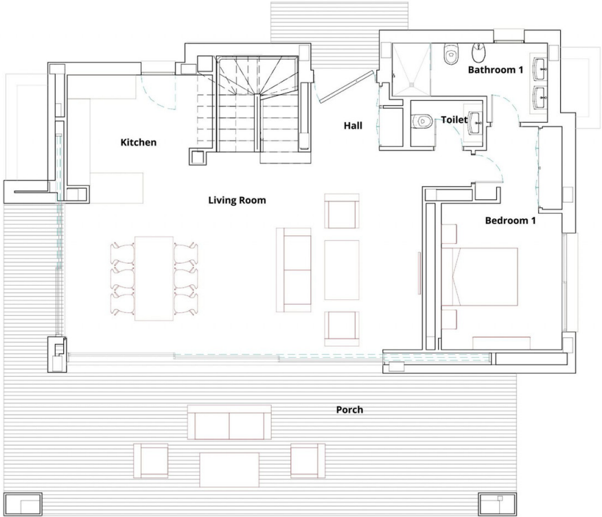
IROKO 4 - BAR GROUND FLOOR