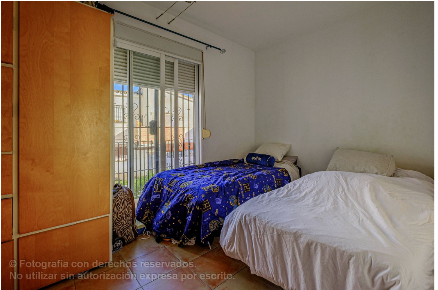
© Fotografía con derechos reservados. No utilizar sin autorización expresa por escrito.