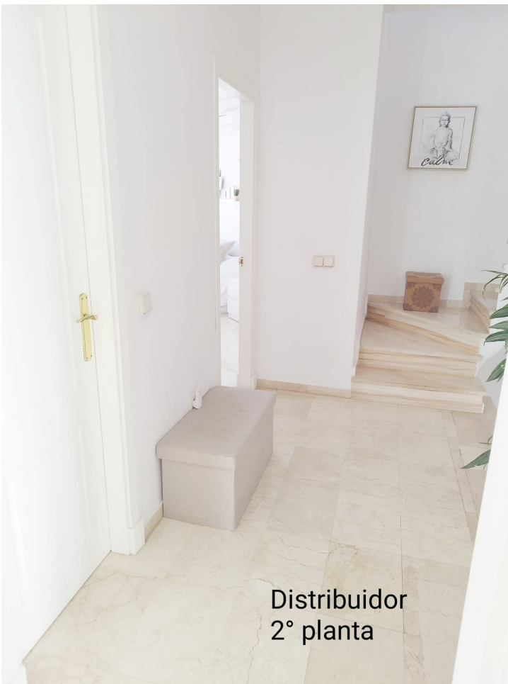
Distribuidor 2° planta