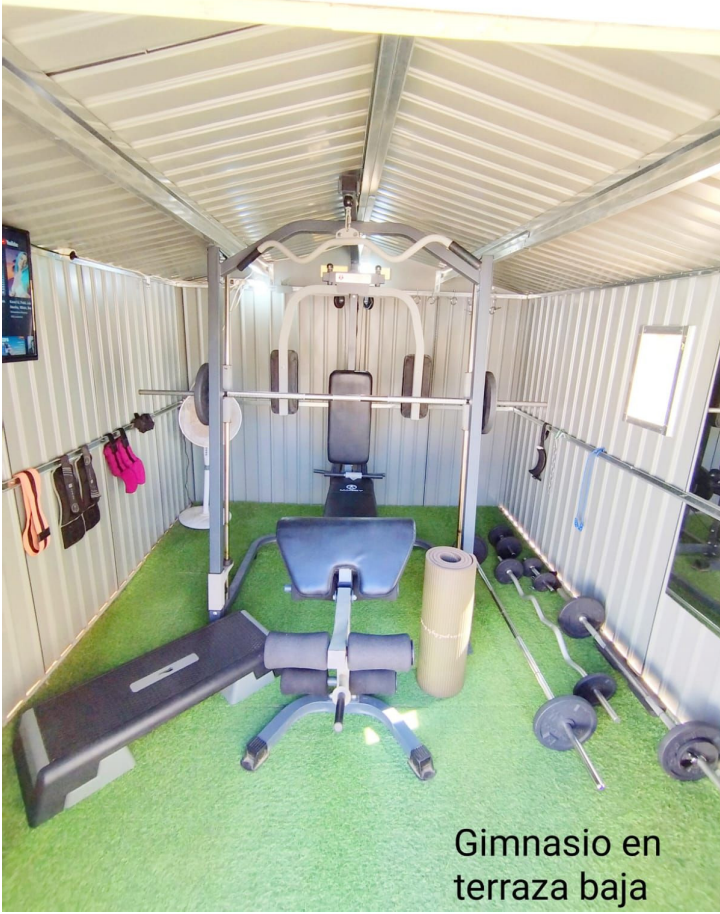
Gimnasio en terraza baja