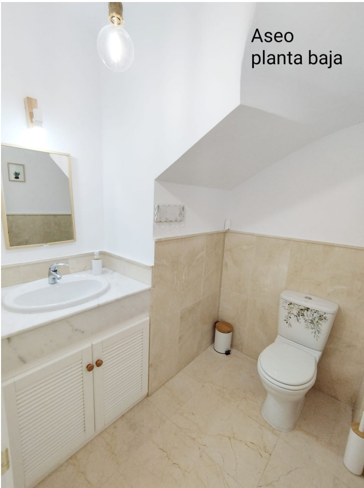
Aseo planta baja