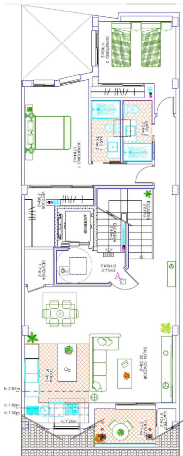
ÁTICO (Bajo Cubierta)